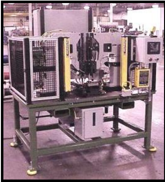
Front View of Machine

Electrical controls include an operator touch screen for load cell readout, a set of light curtains, and dual palm button actuation.