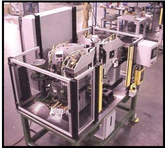
Top View of Machine